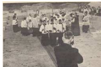
Ground Breaking ~ 1947